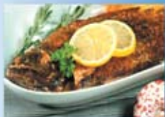
Australian Whole Flounder